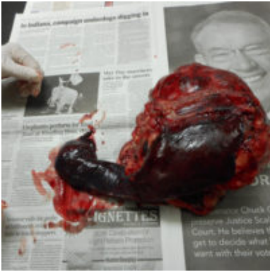
View of the spleen with the attached mass.