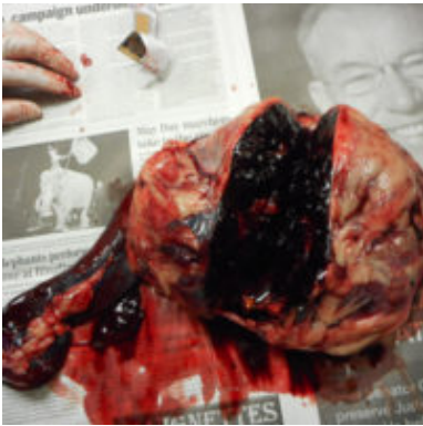
The mass weighed 5 pounds!